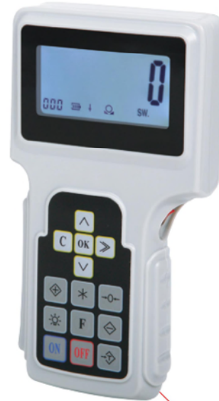
LCD remote controller (included)