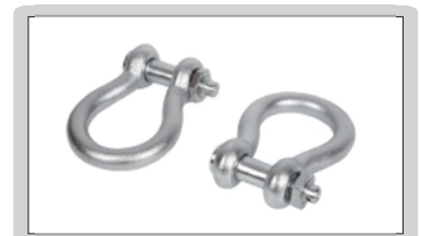
hang scale pull rings (optional)